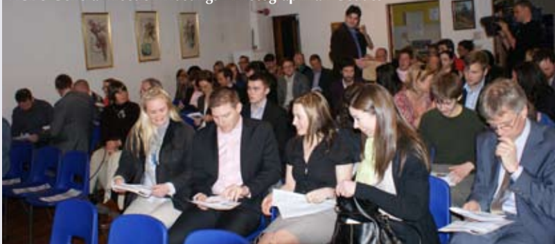
ACDS General Election Hustings

The ESU was packed for the ACDS Hustings followed by the screening of the Leaders' Debate. There were many questions from the audience to the four PPCs. The Guardian recorded the event for a podcast, and the BBC was also there to film it!