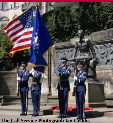
The Call Service