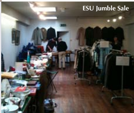
ESU Jumble Sale

In the final were George Heriot's School, the High School of Dundee, Madras College, and Robert Gordon's College. The motion was THW Allow Prisoners The Right to Vote . After two very lively debates this year's Scottish Mace Winners were the High School of Dundee .