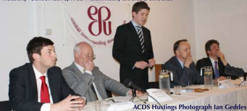
ACDS Hustings

The Readings Day for the Inspired? Get writing! competition took place at the Hawthornden Lecture Theatre at the National Gallery of Scotland on 22nd April. The winning entries were read alongside images of the works that inspired them. All the winners were thrilled to hear their work read aloud. The ESU runs a monthly creative writing group on the 1st Thursday of the month 6.00-8.30pm.