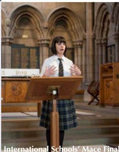
International Schools' Mace Final