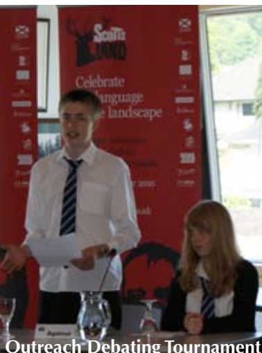
Outreach Debating Tournament