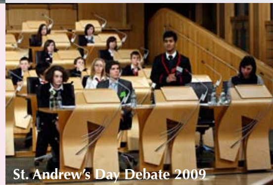
St. Andrew's Day Debate 2009

The ESU Scotland Creative Writing Group takes place from 5.15-7.15pm on the 1st and 3rd Thursday of the month. The group is growing and producing excellent work. Over the next few months we will be looking at effective beginnings, poetry and lyrics, science fiction, and research. The group is open to all writers who are interested in developing their skills.