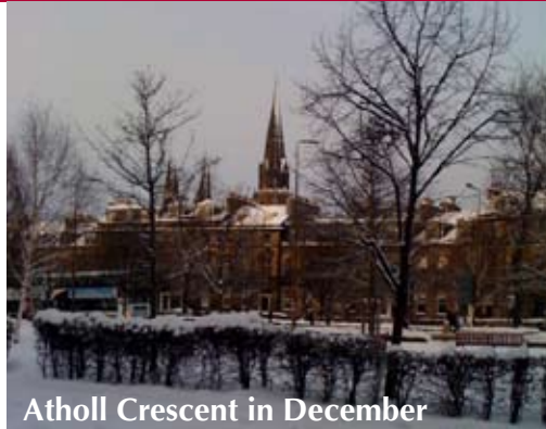
Atholl Crescent in December

Happy New Year from all of us at ESU Scotland! We hope you had a wonderful Christmas and we wish you a happy and healthy 2011. Due to the snow in December we had to cancel a number of events, which will now take place over the next month. As ever, we are always looking for people to help out with anything from judging debates to helping at events so please do get in touch with us to get involved!