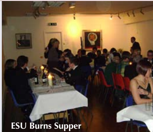
ESU Burns Supper

Our annual Burns Supper will take place at 7.30pm on Saturday 29th January with a yummy 3-course dinner and traditional entertainment. This is one of our most popular members' events, so please get in touch as soon as possible to book your place. It costs £15 for dinner (BYOB) and there will be also be raffle, so any prizes donated will be gratefully received. If you have a secret talent for recitations and you would like to do a "turn" then please contact the office.