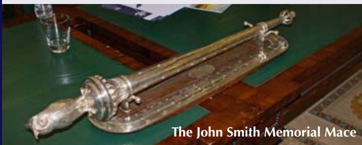
The John Smith Memorial Mace

The ESU John Smith Memorial Mace , the most prestigious intervarsity debating competition will take place at the Glasgow University Union on Saturday 13th February. The Scottish competition has moved to a one-day event, starting at 11am and lasting all day with the final in the early evening. Former winners include the late Donald Dewar and the late Labour leader, John Smith, in whose honour the competition was renamed. Please come along and support the teams, in what will certainly be a day of debating of the highest standard. The competition is generously sponsored by Baillie Gifford .