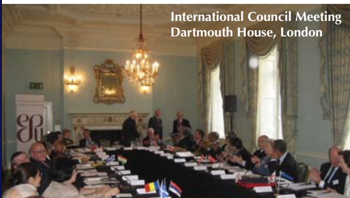
International Council Meeting Dartmouth House, London