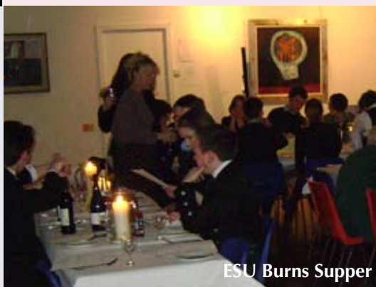
ESU Burns Supper

Our Inspired? Get writing! Creative Writing Competition , with the National Galleries of Scotland, and the Scottish Poetry Library, has now closed, with over 800 entries, from as far away as Hong Kong and Germany as well as from all over Scotland. Judging takes place in March and the winners will be announced in early April.