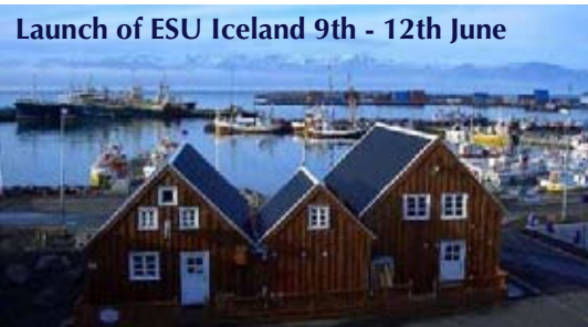
Launch of ESU Iceland 9th - 12th June