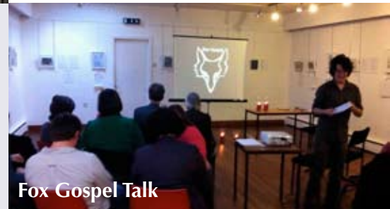
Fox Gospel Talk

The next creative writing group meeting is on Thursday 5th May from 5.15-7.15pm. New members are always welcome, and next session we will be looking at different kinds of Science Fiction writing. The group is very friendly and supportive so it's a great place to get writing.