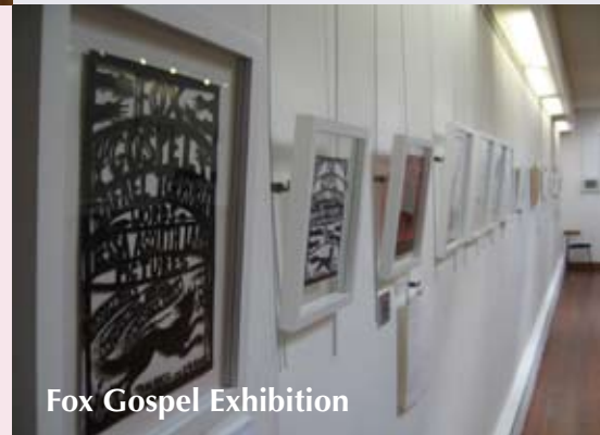
Fox Gospel Exhibition

Generously sponsored by HSBC, the ESU Schools Public Speaking Competition heats took place in Aberdeen, Edinburgh and Glasgow on Saturday 2nd April. The 53 pupils competing gave imaginative speeches on the 'Big Society', and 8 pupils were selected to take part in the final in June. Many thanks to HSBC for hosting the event, and to the participants, teachers, parents and judges.