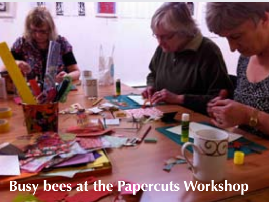
Busy bees at the Papercuts Workshop