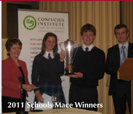
2011 Schools Mace Winners

The Scottish Schools' Mace Final took place at the Playfair Library, Edinburgh, on 26th March, the culmination of a six-month competition, with 72 teams across Scotland. This is the second year that the Confucius Institute has sponsored ESU competitions, and their continuing support is very much appreciated. In the first debate, Stewart's Melville College and Dollar Academy went head to head on the motion This House Would Abolish the One Child Policy in China . ▶